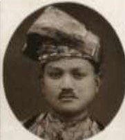
H.M. THE YANG DI PERTUAN OF NEGERI SEMBILAN. (3rd carriage.)