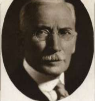
THE RT. HON. J. R. M. HERTZOG, Prime Minister of the Union of South Africa. (7th carriage.)