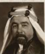
THE AMIR ABDULLAH OF TRANSJORDAN. (1st carriage.)