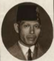
THE SULTAN OF BRUNEI, (3rd carriage.)