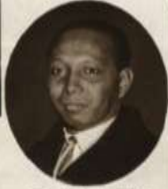
THE SULTAN OF PAHANG. (3rd carriage.)