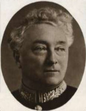
THE RT. HON. W. L. MACKENZIE KING, Prime Minister of the Dominion of Canada. (10th carriage.)