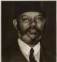
SIR MUHAMMAD ZAFARULLAH KHAN, Representative of India. (6th carriage.)