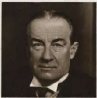
THE RT. HON. STANLEY BALDWIN, Prime Minister of the United Kingdom. (11th carriage.)