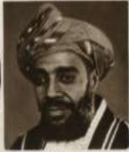
THE SULTAN OF SARAWAK. (1st carriage.)