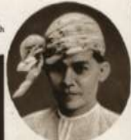
DR. BA MAW, Representative of Burma. (6th carriage.)