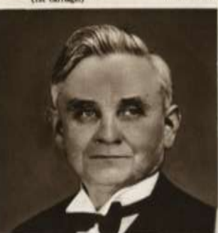
THE RT. HON. M. J. SAVAGE, Prime Minister of the Dominion of New Zealand. (8th carriage.)