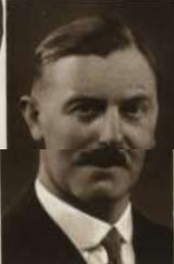
THE RT. HON. J. A. LYONS, Prime Minister of the Commonwealth of Australia. (9th carriage.)