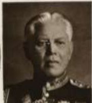
THE SULTAN OF JOHORE, (2nd carriage.)