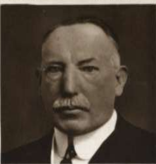
THE RT. HON. VISCOUNT CRAIGAVON, Prime Minister of Northern Ireland. (4th carriage.)

The Royal Procession from Westminster Abbey back to Buckingham Palace was augmented by the carriages containing the British and Dominion Prime Ministers, representatives of India and Burma and Colonial Rulers. These preceded their Majesties in the State Coach in the order given above—the reverse of the order in which they drove to the Abbey. The Colonial Rulers were escorted by troopers of the 16/5th Lancers. Mr. Baldwin had an escort of Metropolitan Mounted